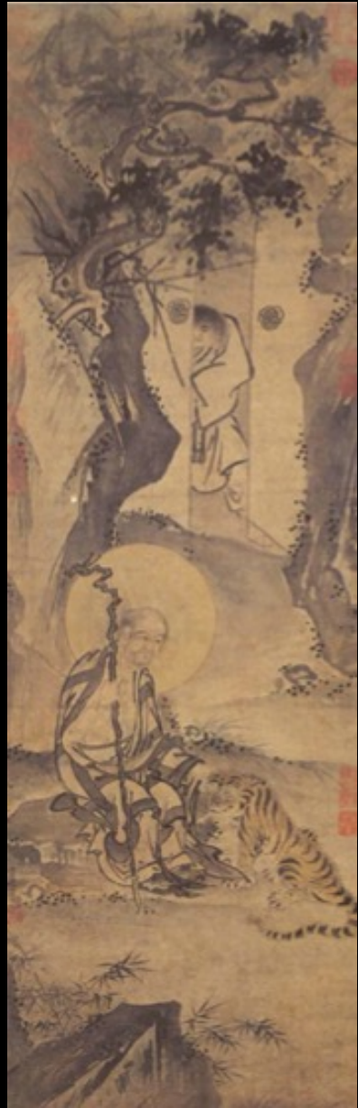
Dai Jin (1388-1462), Bhadra and Tiger , National Palace Museum, Taipei