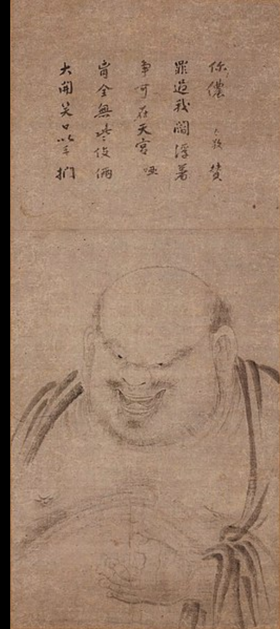
Attributed to Muxi Facang (act. 13 th c.)