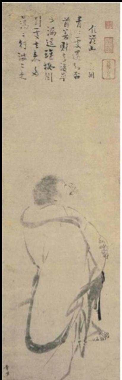
Li Que (13th C.) Budai (pre. 1263)